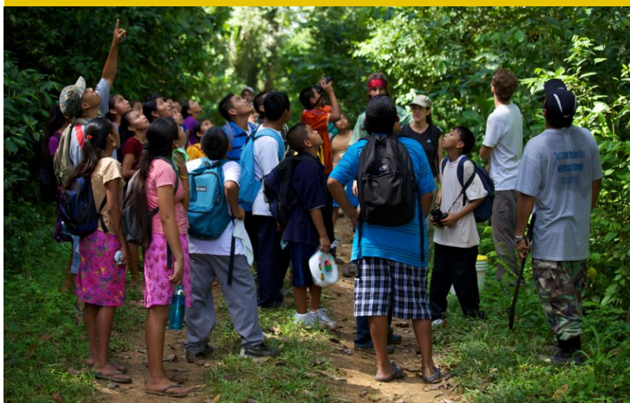
School trips are regularly arranged to Bladen Nature Reserve and other protected areas as a part of our environmental education.

As a Ya'axché member you will get regular updates on our work and small tokens of appreciation. EcoTourism Belize, our sustainable financing venture, provides ecotours, service learning opportunities and rustic accommodations in and around Golden Stream Corridor Preserve. Volunteers who have worked at Ya'axché found their experience most rewarding.