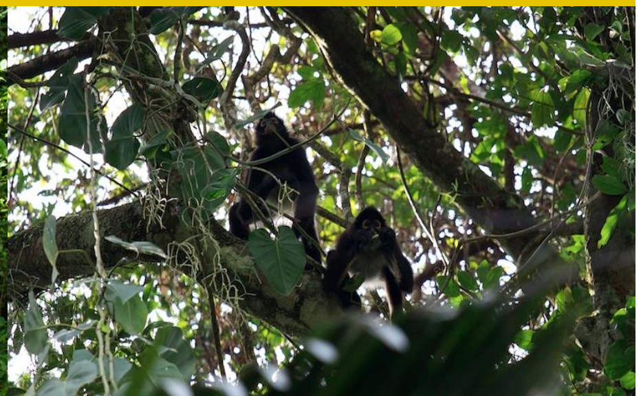
Geoffroy's spider monkey, ( Ateles geoffroyi) is found in Bladen Nature Reserve. The species is classified as Endangered by IUCN.